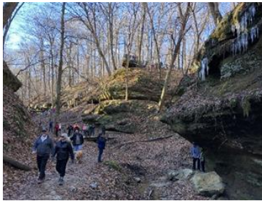
Hikers at Wildcat Den State Park

Each year, thousands of visitors from all over the country come to hike the trails and explore the unique rock formations named by the early settlers. The Devil's Punchbowl, Steamboat Rock, and my favorite, Fat Man Squeeze (I am proud to say I have not gotten stuck in that pass yet. Ha!)