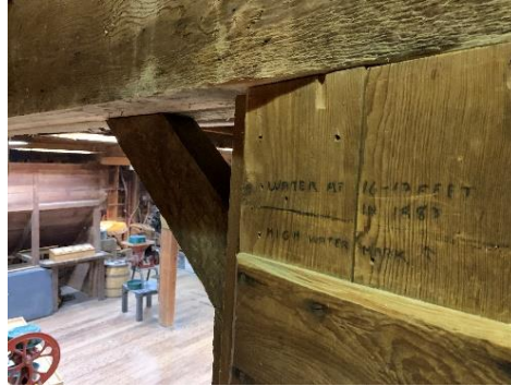
The Big 1883 Flood

If you have been to the mill you may have seen a flood “high water” mark on the door leading to the 2 nd floor. It is surprisingly high on the door. Here are 2 stories as reported from Elbert Clemens who lived in the area in the late 1800s.